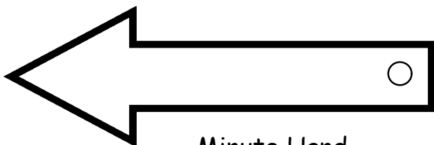
Minute Hand - Color Red